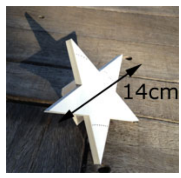
+ Big width= 145 mm depth 45 mm

Thanks to technology of the 3D printers which authorizes a very big thinness of material. This star in resin offers a very beautiful transparency and an incomparable wealth of details. During Christmas time, it will become integrated perfectly into the side of the porcelain sea urchins of your lamp " the Oursimière" to put you stars in the eyes !